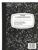
Composition Book 9 ¾" x 7 ½"