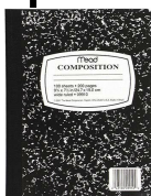
Composition Book 9 3/4 " x 7 1/2 "

Please note that your child's teacher may have a "wish list" for additional supplies the first week of school. This would be specific to the classroom's needs if you would like to donate.